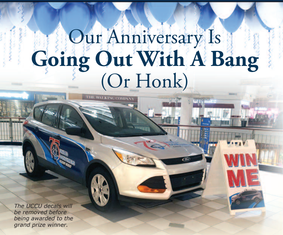
The UCCU decals will be removed before being awarded to the grand prize winner.

Throughout 2016, United Consumers Credit Union celebrated our 75th anniversary with amazing gifts for our members and the community. At our annual meeting in February, we'll cap this major milestone by awarding our sweepstakes grand prize – a 2016 Ford Escape!